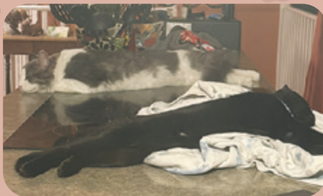
Flair and Little Lady, Strathcona Park