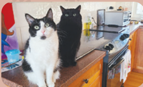
Meatball and Cleo, Renfrew