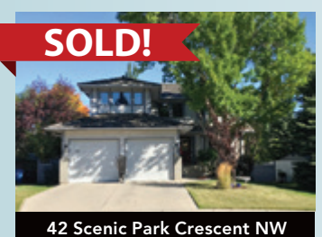
5 Bdrms, Fully Finished, Pie Lot $879,900