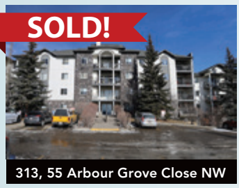
2 Bdrms, Underground Parking $289,900