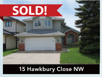
3 Bdrms, Steps to Playground $649,900

3D tours, detailed floor plans, plus much more with our proven marketing and state-of-the-art technology. Call for your <u>free home evaluation</u> today!