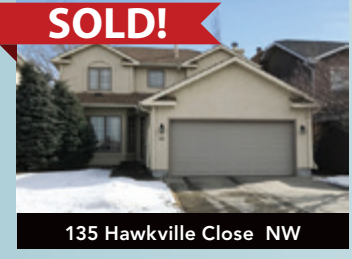
4 Bdrms, Fully Finished, Mtn Views $699,900