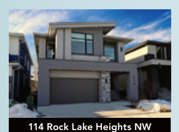
6 Bdrms + Den, 3 Car Garage $1,629,900