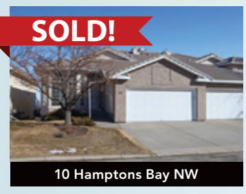
2 Bdrms + Den Villa, on Golf Course $849,900