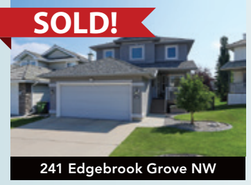
Cardel 4 Bdrms + Den, Cul-de-Sac $799,900

3D tours, detailed floor plans, plus much more with our proven marketing and state-of-the-art technology. Call for your <u>free home evaluation</u> today!