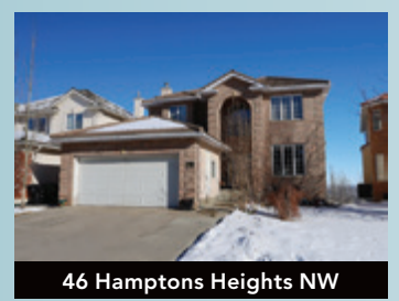
6 Bdrms, Walkout on Golf Course $1,220,000