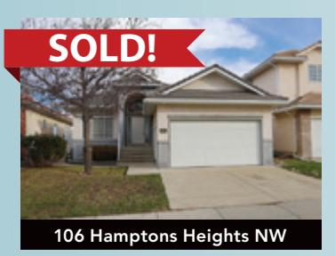
4 Bdrms, Walkout on Golf Course $1,049,000

Sell your home quickly for asking price, possibly above!!