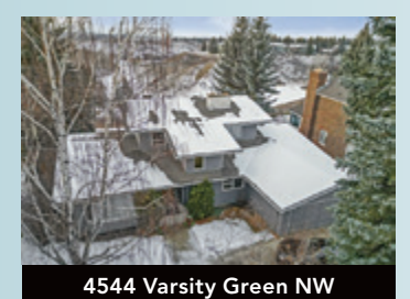
Custom 4 Bdrms, on Golf Course $2,500,000