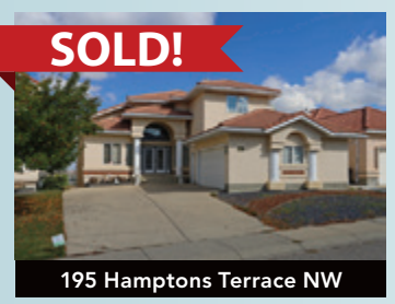
5 Bdrms, Walkout on Golf Course $1,250,000