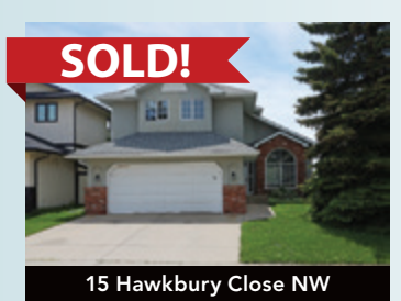
3 Bdrms, Steps to Playground $649,900

3D tours, detailed floor plans, plus much more with our proven marketing and state-of-the-art technology. Call for your <u>free home evaluation</u> today!