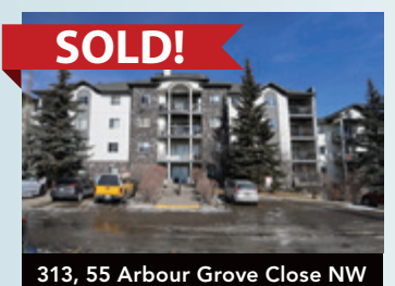
2 Bdrms, Underground Parking $289,900