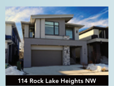
6 Bdrms + Den, 3 Car Garage $1,629,900