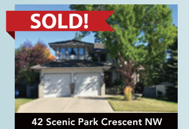
5 Bdrms, Fully Finished, Pie Lot $879,900