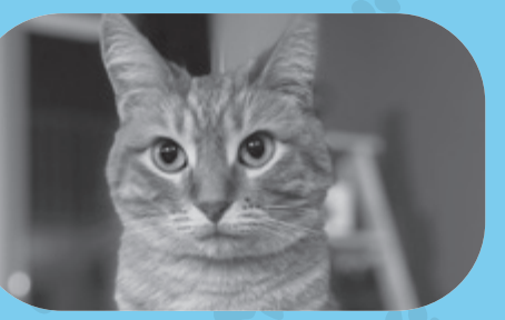
Crouton, Signal Hill