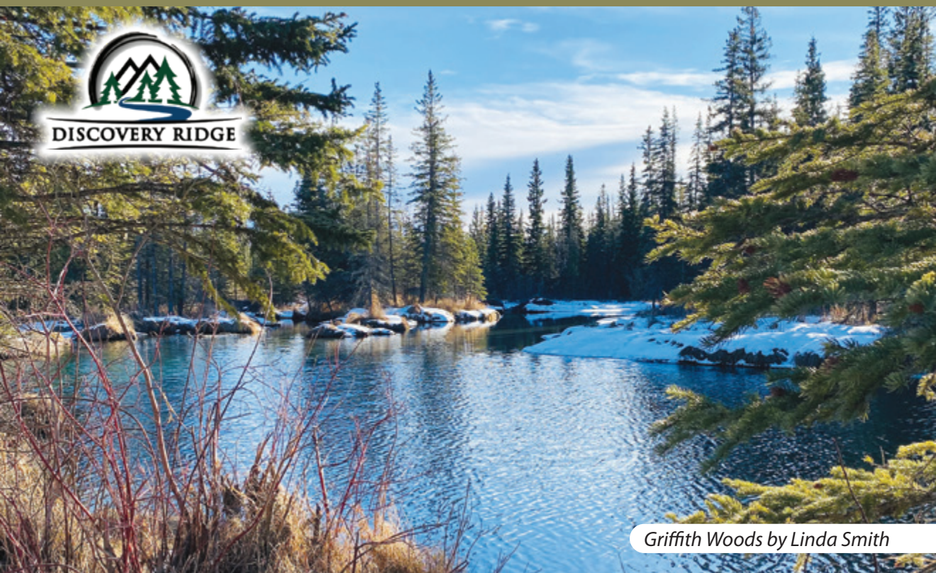
Griffith Woods