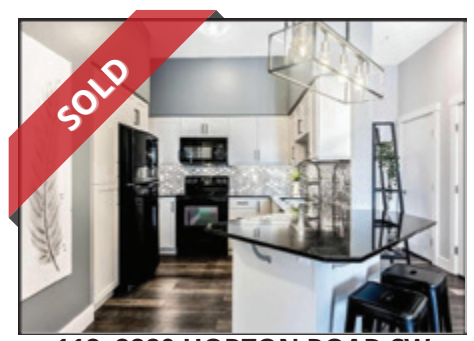
118, 8880 HORTON ROAD SW

2 bedrooms, 2 bathrooms & 975 sqft Fully renovated ground floor unit